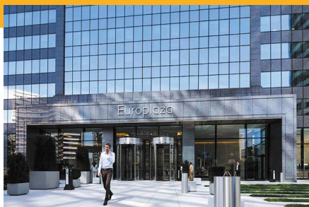
Tour Europlaza - La Défense

179 Av. Frederic et Irene Joliot Curie 92000 Nanterre