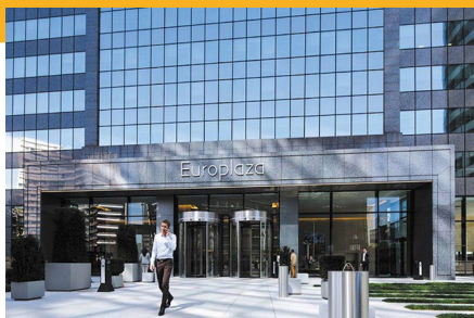
KPMG Tour Europlaza - La Défense